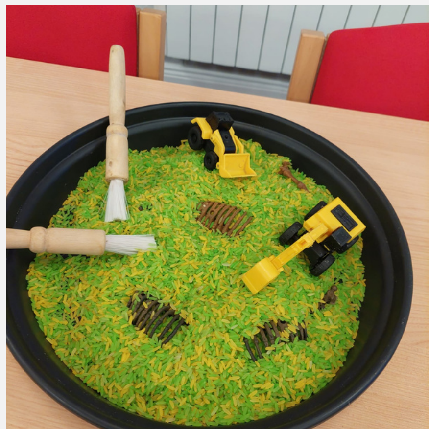
Cork City CC