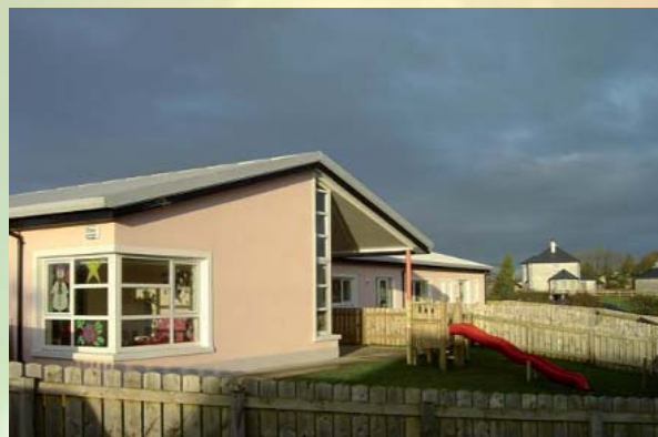
Croghan Fairy Bush, Croghan, Co. Roscommon