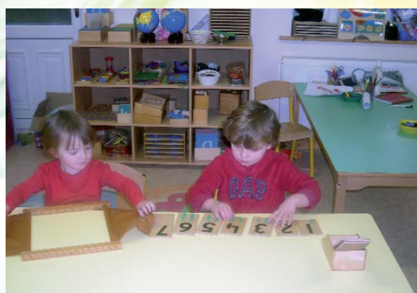
First Steps Montessori, The Glebe, Athleague, Co. Roscommon.