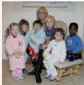
Launch of 2010 NCNA National Pyjama Day