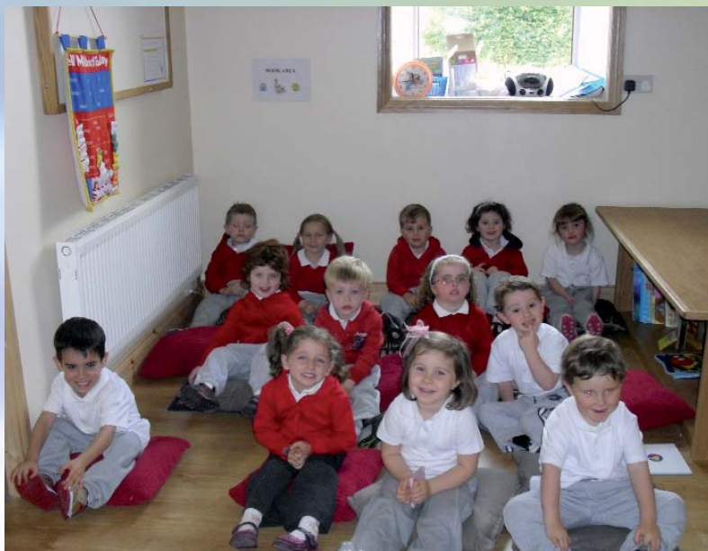
Derrane Pre-school, Derrane, Roxboro, Co. Roscommon